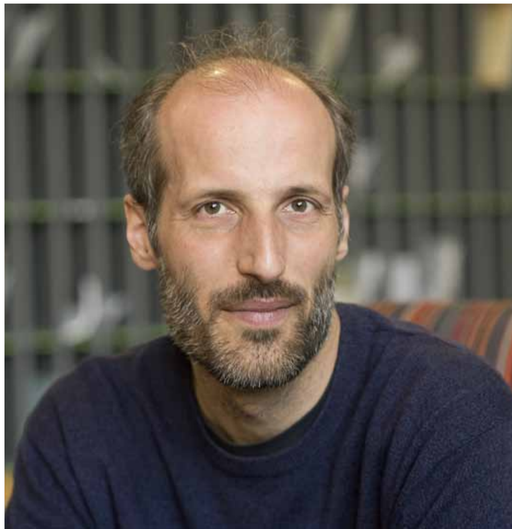
Martin Hairer (Imperial College London)

Place : Graduate School of Mathematical Sciences, The University of Tokyo