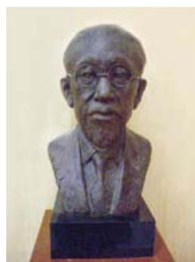
Teiji Takagi (1875–1960)