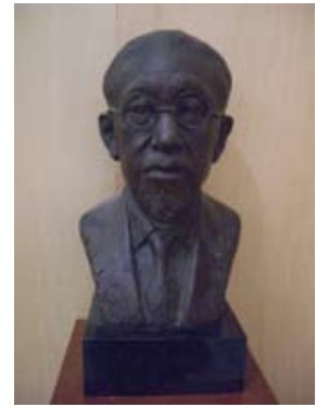
Teiji Takagi (1875-1960)