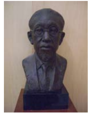
Teiji Takagi (1875-1960)